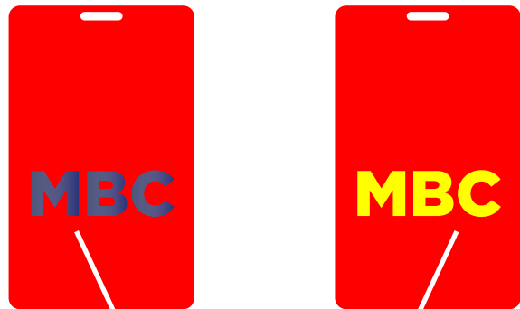
full color printing